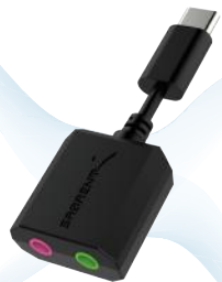
USB Type-C Stereo 3D Sound Adapter

Plug USB Audio Sound Adapter into Type-C port of computer or laptop -- make sure "SABRENT" text on USB Audio Sound Adapter is face up.